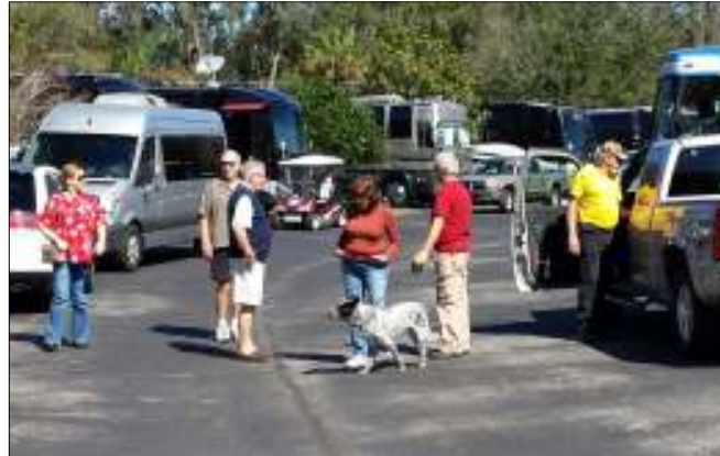
The rally park staff were able to situate all but one of our 25 coaches in the same area.