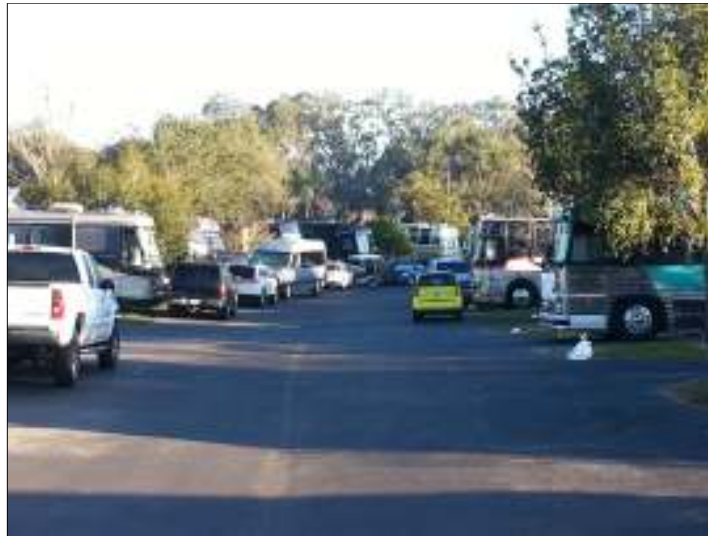
Twenty-five coaches showed up for our annual Valentine's Rally, at LazyDays Rally Park in Seffner, FL. This is an increase of nine coaches over last year!