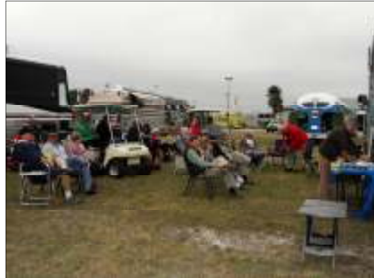
Over 30 member couples attended the President's Reception and general meeting, where our bylaws were amended.