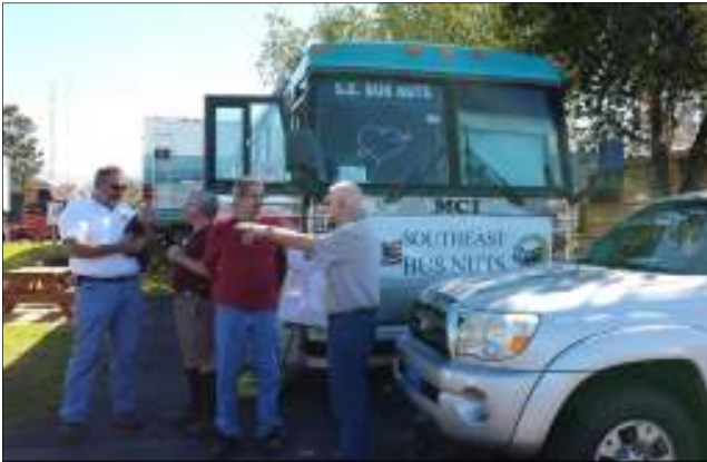
President Bukoski's bus was a central point during much of the LazyDays rally.