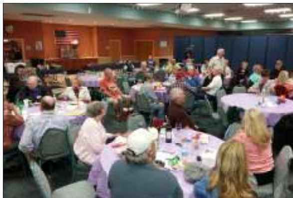
The social hall was a comfortable fit for our 50 attendees at the steak fry on Saturday night.