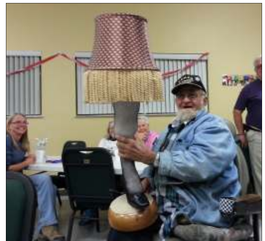
Junior Showman was presented a well-trimmed leg as a gag gift at one of the receptions.