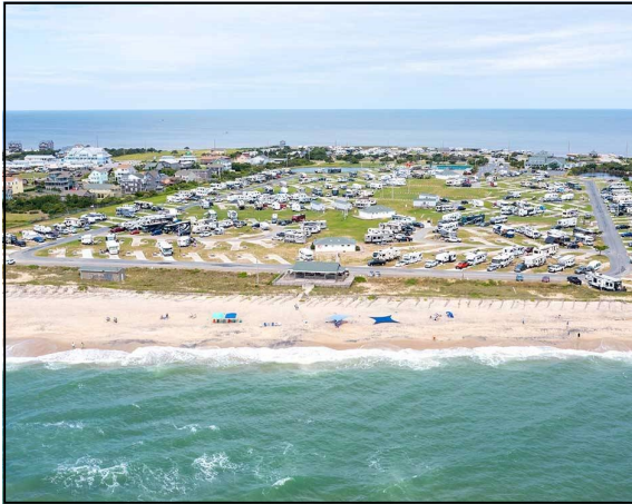
Our RV park, Cape Hatteras Campground and RV Resort, is situated between the Atlantic Ocean and Pamlico Sound. Plenty of refreshing sea breezes and salt scented air!