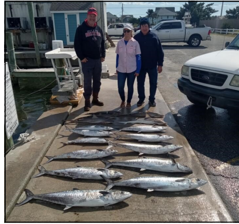
...but a few days later things were cleaned up and the weather turned sunny. Three of our ralliers caught 17 fish on an excursion!