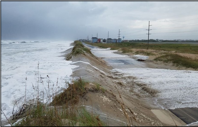
A week before our Outer Banks rally Hurricane Erin caused some flooding and wash-outs...