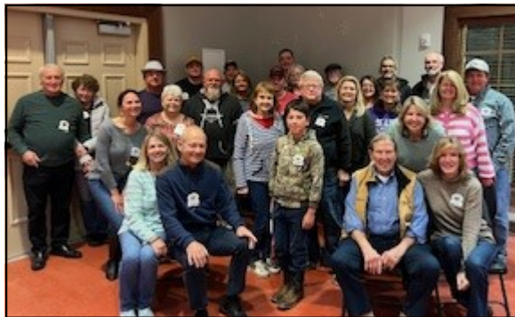
Some 14 buses/couples ventured over to New Orleans for the 2024 Post New Years Rally.