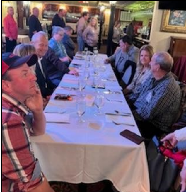
The Mississippi River dinner cruise on Friday-featured fine dining and included delicious Creole and Cajun cuisine. The sounds of a lively jazz band filled the air. It was a festive night!